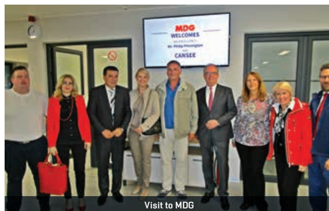
Visit to MDG