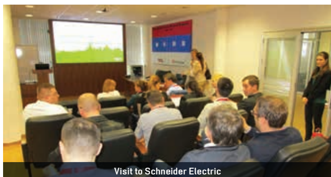
Visit to Schneider Electric

Following the opening ceremony of the LEADER Project Serbia, on May 9 2016, and throughout the two-week program, a number of networking events were organized. Within the program, the participants and instructors got the opportunity to visit Schneider Electric company in Novi Sad and see how the successful business looks like. This