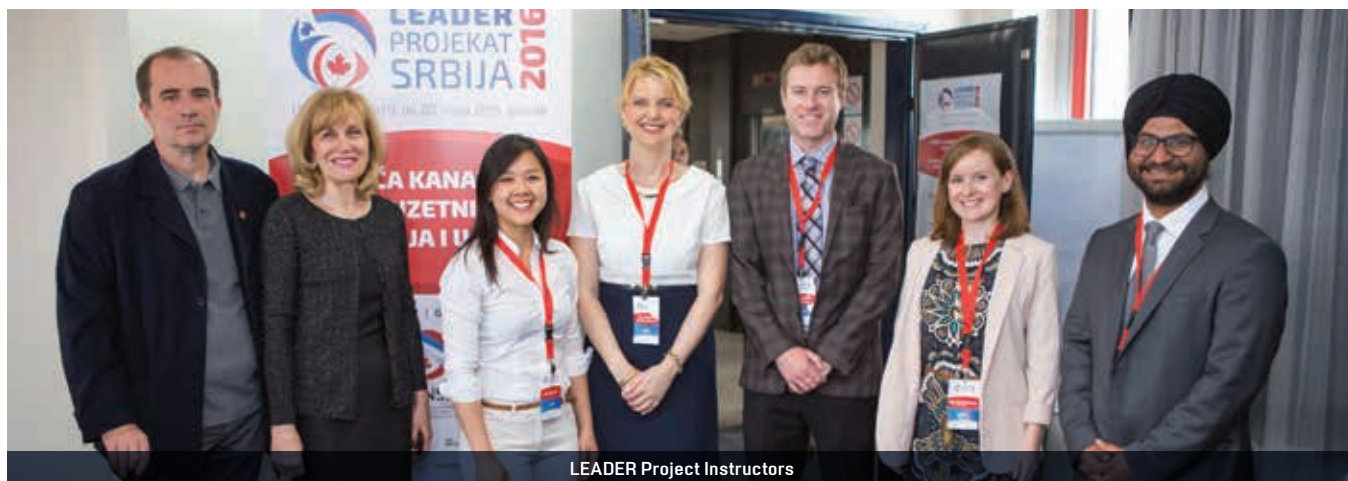
LEADER Project Instructors

LEADER Project Serbia, Canadian educational program from Richard Ivey Business School, was held for the first time in Belgrade from May 9 – 20 2016. This program is offered by one of the top-ranked business schools in the world. LEADER Project was implemented by CANSEE Canadian Serbian Business Association, in cooperation with Chamber of Commerce and Industry of Serbia and Canadian Embassy in Belgrade.