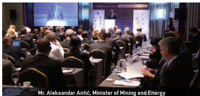
Mr. Aleksandar Antić, Minister of Mining and Energy

CANSEE exploration and mining industry group gathers the biggest Canadian investors in this field. Among them are world-class Canadian companies, such as Nevsun Resources, Mundoro, Dundee Precious Metals, Erin Ventures and Medgold which have so far made significant investments in mining and geological exploration in Serbia. In addition to the aforementioned Canadian companies, members of the association that participated at the Conference are companies Terragold, Jantar group, Georing Group, Contango, Metalfer, Drilexx International, Metso and S&V Drilling Mine Services.