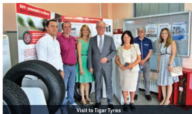
Visit to Tigar Tyres