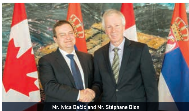
Mr. Ivica Dačić and Mr. Stéphane Dion