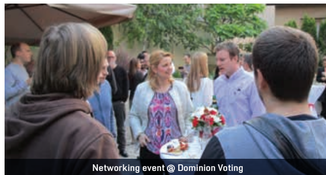
Networking event @ Dominion Voting

global company and a CANSEE member with more than 1,000 workers locally, specializes in energy saving software development in complex power distribution systems. Dominion voting, CANSEE founding member, hosted business networking event in their premises for LP participants and instructors.