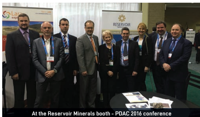
At the Reservoir Minerals booth - PDAC 2016 conference