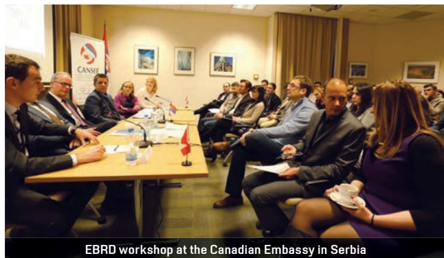
EBRD workshop at the Canadian Embassy in Serbia

On January 28, 2016 at CANSEE General Meeting, "EBRD Workshop" was held, where the EBRD Director in Serbia,