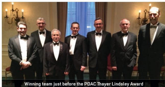
Winning team just before the PDAC Thayer Lindsley Award

CANSEE had an exceptional honour to attend, together